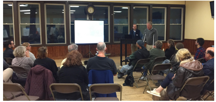
Open house meeting