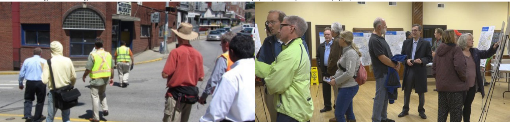
Morgantown Regional Pedestrian and Bicycle Master Plan field trip (left) and open house (right)