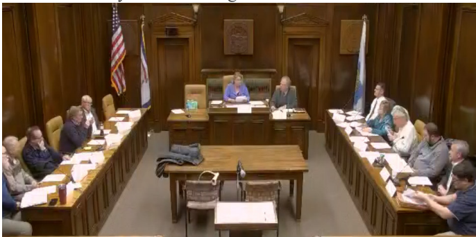
MMMPO Policy Board Meeting

The policy board meeting occurs on the third Thursdays of January, March, May, June, August, October, and November. The board makes decisions on policy, strategy, and operation of the MMMPO.