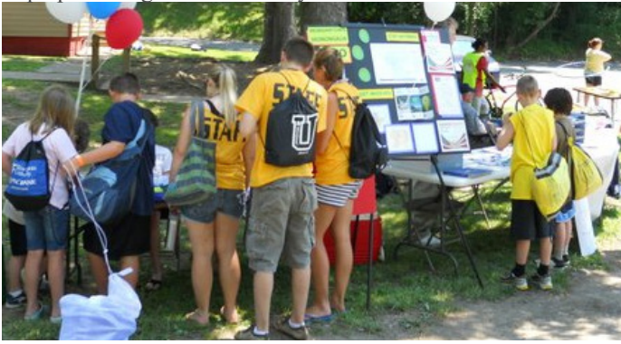
Pop up meeting at a community event